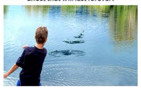
How we live today will have a rippling Effect that will last forever!

In the same way, the way we live our lives today, and every day, has a rippling effect that will go on for eternity! The things that we do and say today will affect our eternal reward and how much we can reflect God's glory. In one sense, we are creating today the person we will be for eternity.