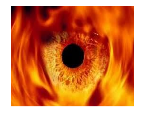
Revelation 1:14 "His head and his hairs were white like wool, as white as snow; and his eyes were as a flame of fire."

In other words, the whole narrative of our lives will be brought out into the light of God's fiery omniscience. The vision of the glorified Christ reminds us that His eyes are like a penetrating fire that reveals everything.