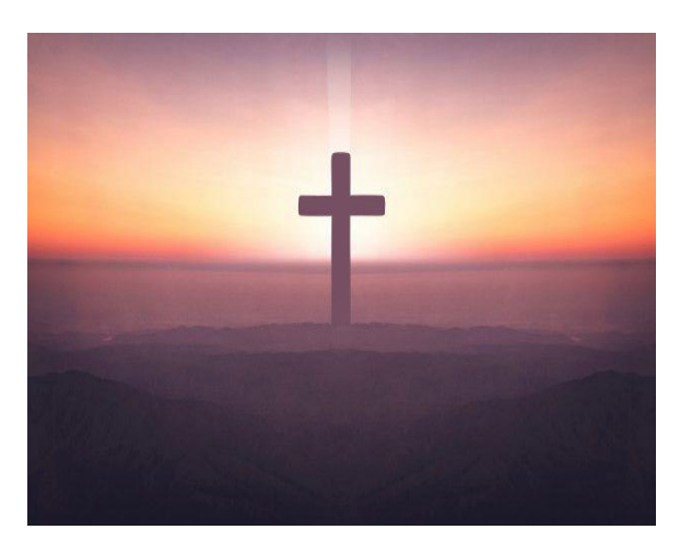
The Angels Master Plan

Many wonder why this great evil atrocity occurred on earth. The Bible gives us an important clue. Because of a previously revealed prophecy in Genesis 3 concerning Satan's demise, his main goal in all this earthly corruption of humanity was to spiritually pollute and destroy the godly line of Seth through which the Messiah would be born.