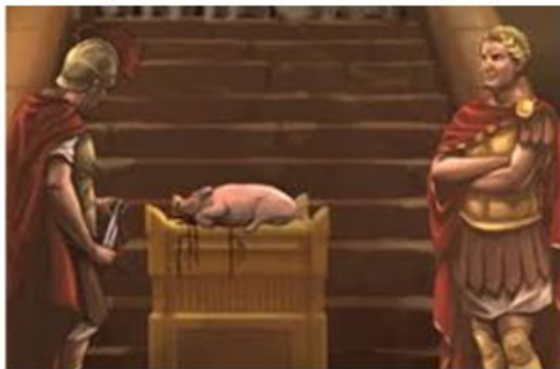
A foreshadowing of Antichrist's Abomination of Desolation

Historically, on December 14, 168 B.C., Antiochus IV built and erected an altar to Zeus (the god of Greece) in the sanctuary (holy place) and then had a pig offered on the altar of burnt sacrifice in honor of Zeus. The Jews were compelled to offer a pig on the 25th of each month to celebrate Antiochus Epiphanes' birthday. The statue of Zeus