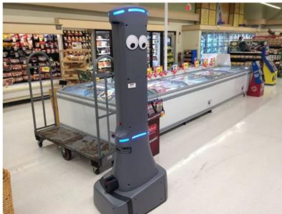
Marty the Walking Robot

Or just go to Giant Store. They have a walking computer named “Marty” that moves around the store watching for shoplifters and making his presence known. Talking computerized robots is nothing new. But a statue made out of wood, stone, and other precious metals which actually talks would grab the attention of the world.