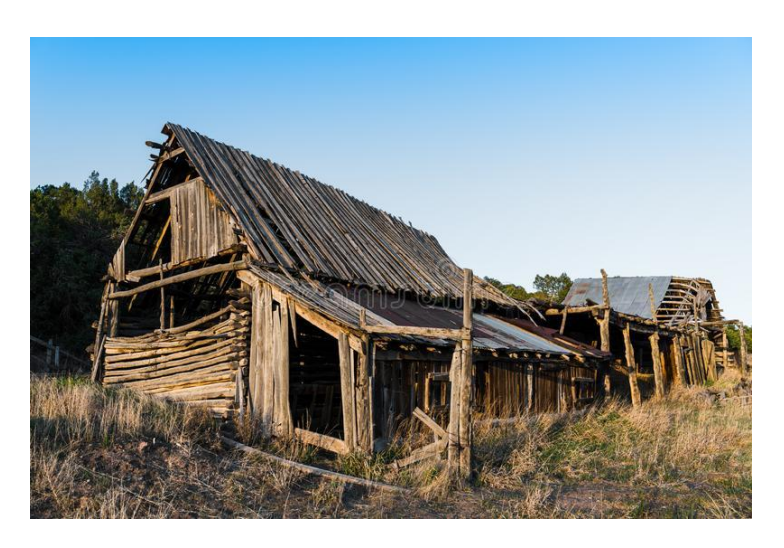
"I looked upon a farm one day. That once I used to own; The barn had fallen to the ground. The fields were overgrown.

One must wonder if some of our hearts will reflect upon our past life in the way Theodore W. Brennan recorded in his revealing poem.