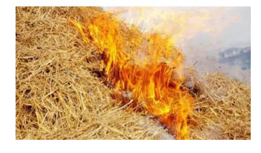
Wood, Hay, and Stubble = Loss of Reward

Of course, the worthless works that won't last are illustrated as "wood, hay, stubble" (the perishable junk). They are labeled as the "bad" works in 2 Corinthians 5:10 and will result in the loss of reward.