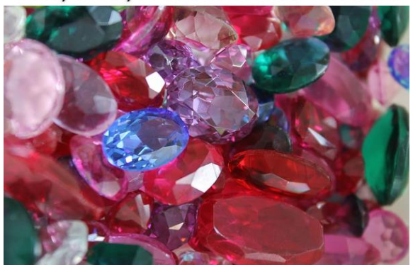
Gold, Silver, Precious Stones = Reward

precious stones" (the permanent gems). These good works will result in reward. They will be deemed worthy and respectable to God and therefore the Christian servant will earn reward for these particular deeds.