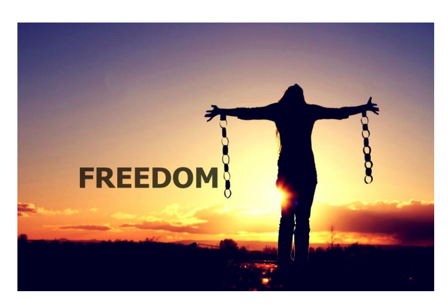
"I'm free from the fear of tomorrow, I'm free from the guilt of the past, For I've traded all my shackles, For a glorious song, I'm free, praise the Lord, free at last!"

A person must repent of their pagan philosophies and rebellion against God before they can understand the Biblical concept and need for eternal life (John 6:47) and before they can commit their faith alone to Christ for salvation (2 Tim. 1:12). No, we cannot be truly free from sin and unbelief without wanting freedom and experiencing it through the saving and life-transforming grace of the Lord Jesus Christ (Titus 2:11-12).